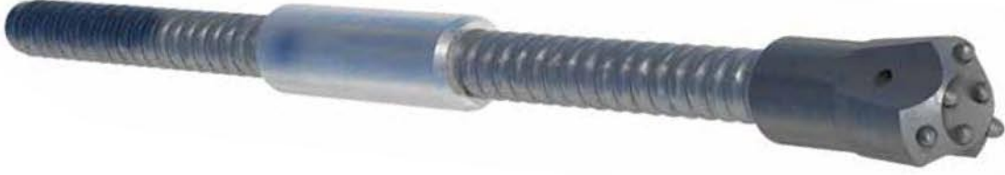
Technical Data – Self-Drilling Hollow Bar